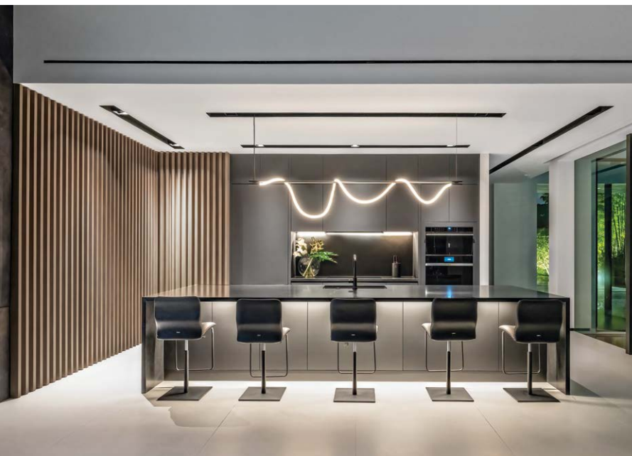
BELOW: For the chef's kitchen in this residence by THE DECORATORS UNLIMITED , the design team employed matte black cabinetry with no handles and honed black granite for the countertops. The LED light fixture by Luke Lamp Co. was chosen because it reminded the homeowner of Wonder Woman's lasso.